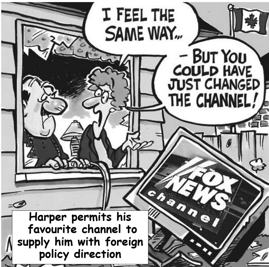
Harper permits his favourite channel to supply him with foreign policy direction

A compelling endorsement for Al Jazeera comes from Roger Cohen of the New York Times , who nicely sums up the tremendous value of AJE: "its striving for balanced reporting from a distinct perspective seems genuine". He further states: "Comparative courses in how Al Jazeera, CNN, the BBC and U.S. net-