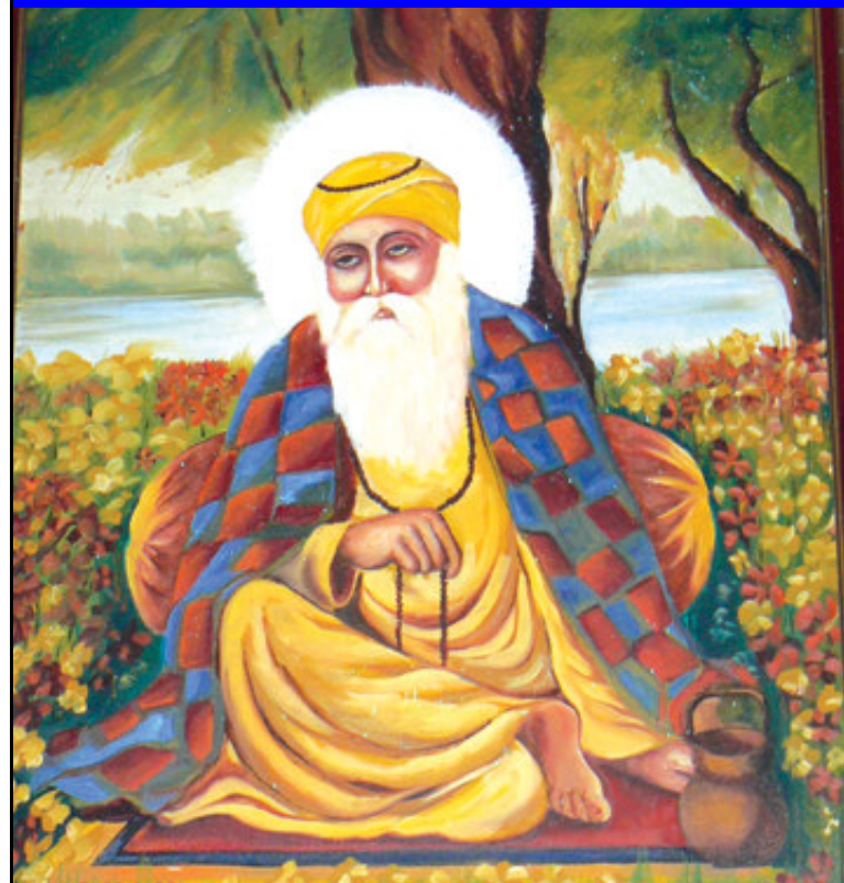
Shri Guru Nanak Dev Ji (1469-1539)